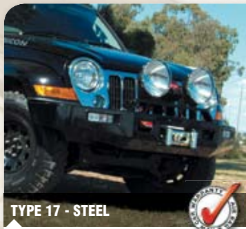
TYPE 17 - STEEL