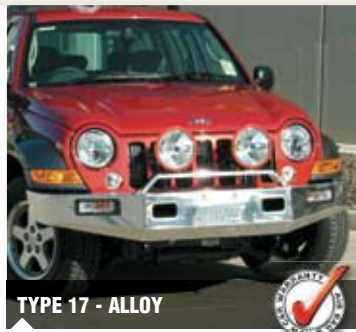
TYPE 17 - ALLOY