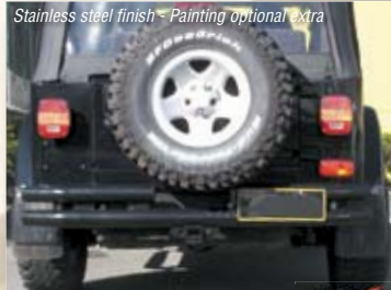
TWIN TUBE - STAINLESS