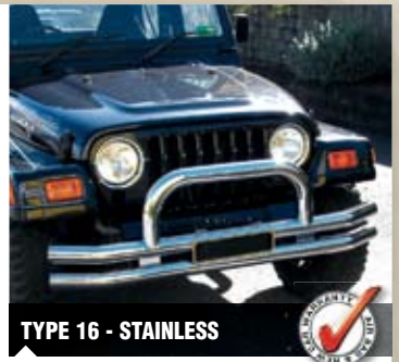
TYPE 16 - STAINLESS