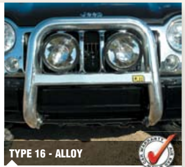
TYPE 16 - ALLOY