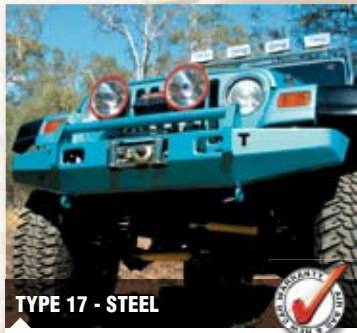
TYPE 17 - STEEL