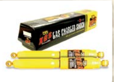
XGS SUSPENSION YEAR 3 WARRANTY