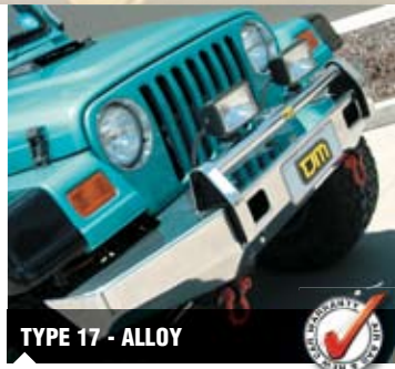
TYPE 17 - ALLOY