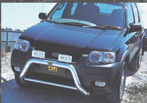
Grille Guard - T16 Aluminium