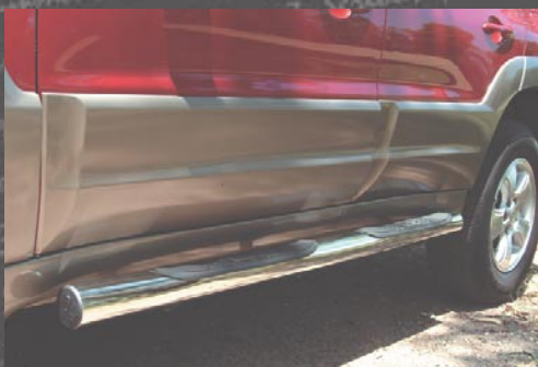
Tubular Stainless Steel Steps

The stylish and sporty T16 Grille Guard is manufactured from 76 & 45mm diameter aluminium tube, is brightly polished, and fits neatly over the existing front bumper. It includes provision for mounting driving lights.